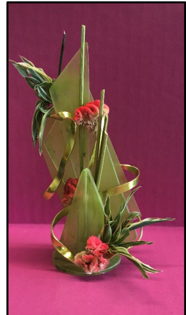
Creative Design by Debby Cooper, 5" Tall

The schedule for the show (which is merely guidelines for the show and each design class) includes a variety of design types that become more interesting because they are so small. A petite design might have a bottle cap as a container, or a small candlestick could hold a cascade design. There will even be a class of petite table designs.