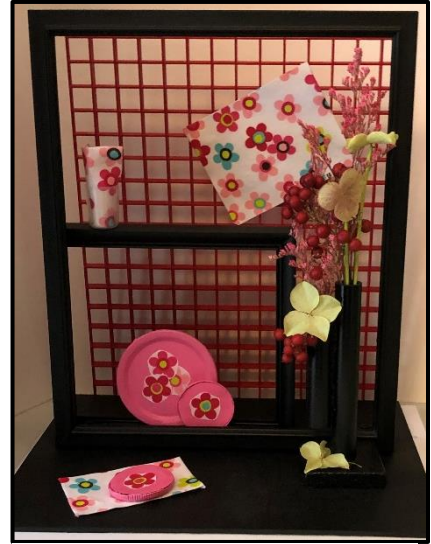
Exhibition Table Design by Amye Kelly, 12" Tall

The state flower show, titled "Girl Power", will be held during the state convention in Brandon next April (more about the convention in the next newsletter). The show is a Petite Design Specialty show, which means that it consists of designs only (no horticulture) and that all the designs are petite designs, meaning that they range in size from 3 inches tall to not more than twelve inches tall.