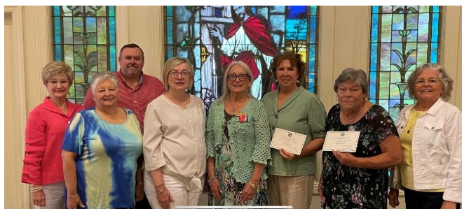
Brandon Garden Club