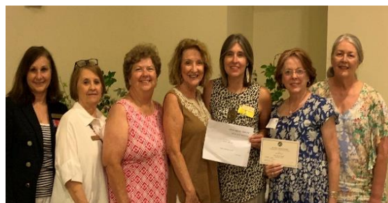
Wesson Garden Club