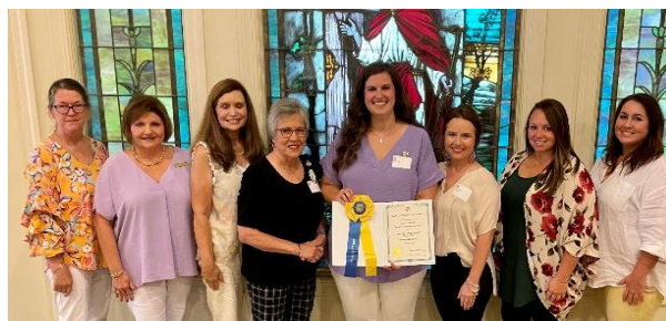
McComb Garden Club