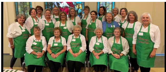
Chautauqua Garden Club